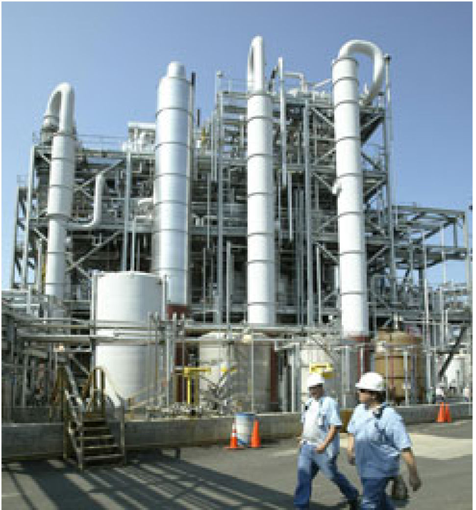
Figure 1: DuPont Tate & Lyle PDO Biorefinery.

100 million lbs. per year, 1,3 propanediol Start Date: November 2006.