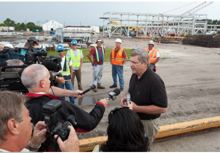
Figure 5: USDA Sec. Tom Vilsack checks construction progress, August 2011.

Figure 4: INEOS Bio New Planet Energy groundbreaking February 2011.