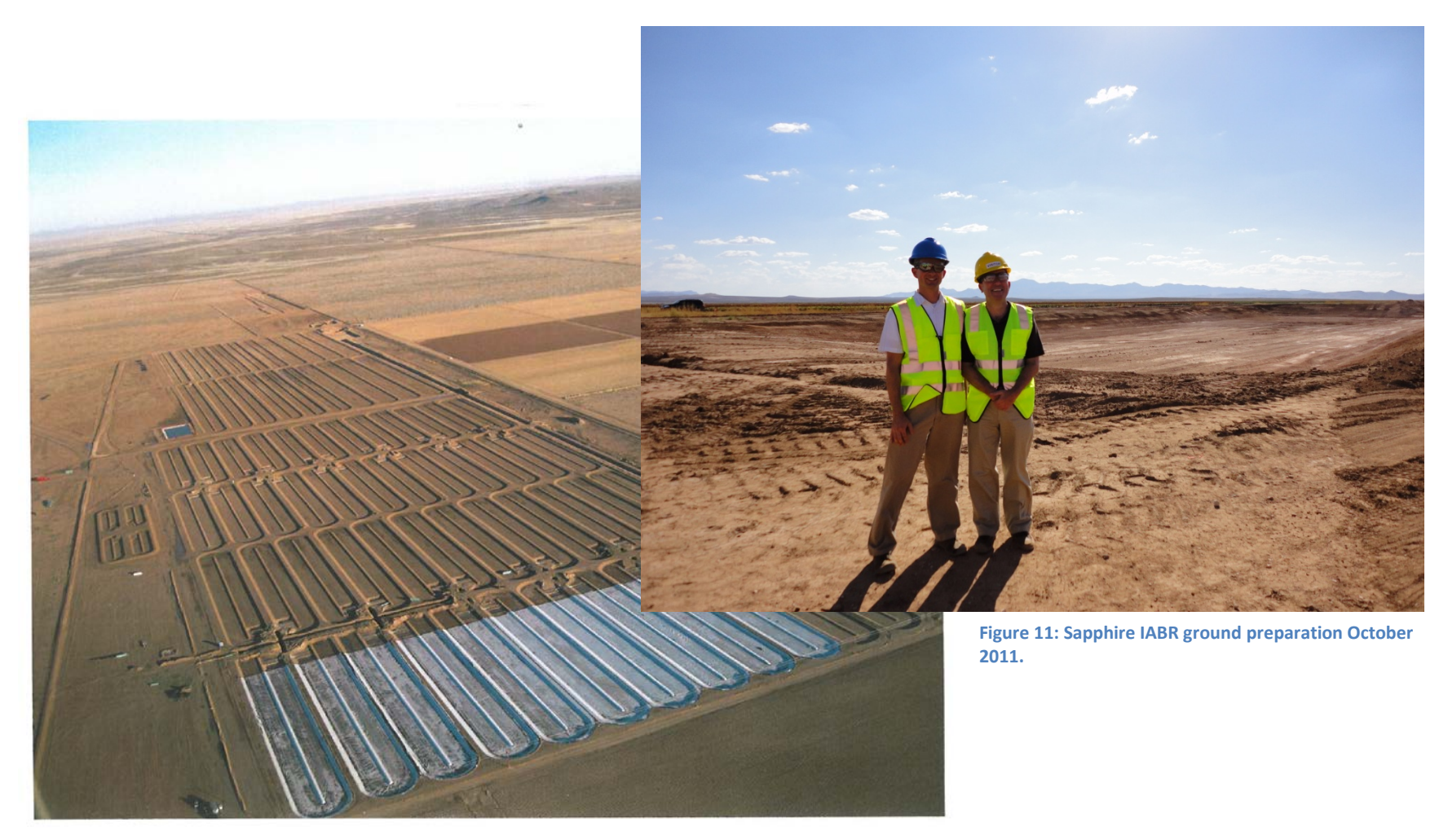
Figure 10: Sapphire IABR construction progress November 2011.

1 million gallon per year integrated algal biorefinery. Start Date: 1Q 2014