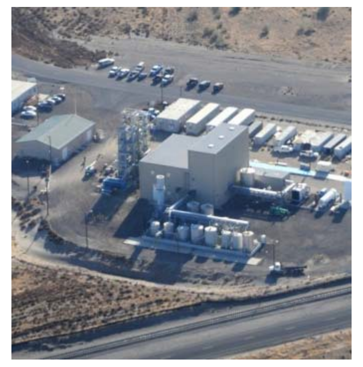
Figure 12: ZeaChem demonstration biorefinery, aerial view.

250,000 gallon per year cellulosic ethanol and acetyl acid. Start Date: 4Q 2011