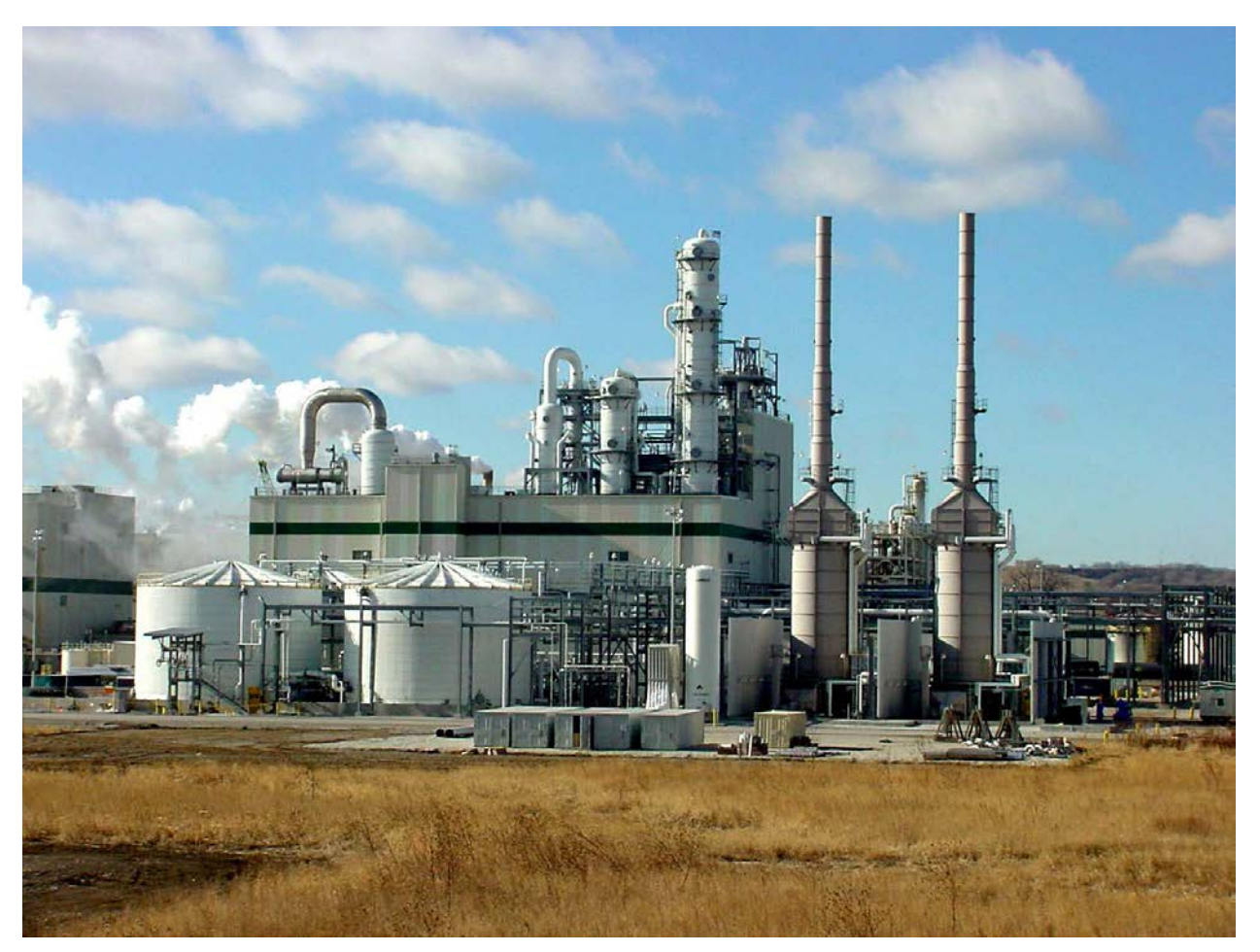
Figure 7: NatureWorks PLA biorefinery, in operation since 2002.

140,000 tons per year PLA Start Date: 2002