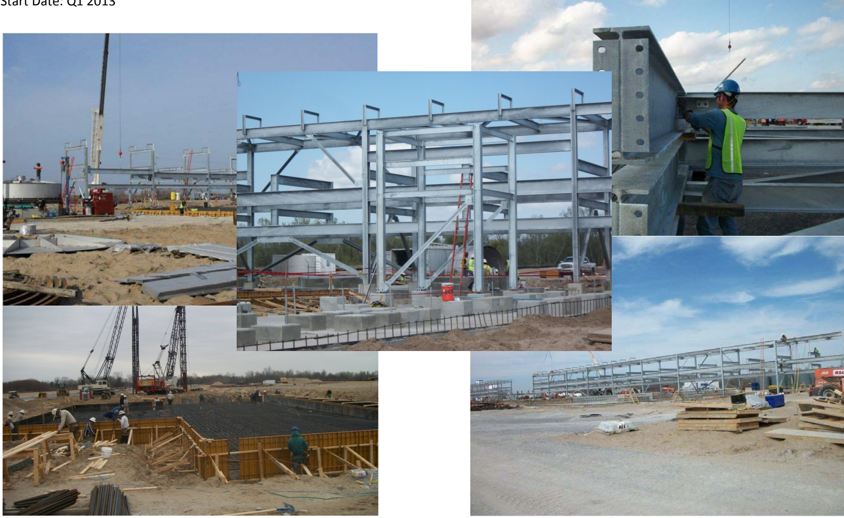
Figure 6: Myriant construction progress March 2012.

30 million lbs per year of bio-succinic acid. Start Date: Q1 2013