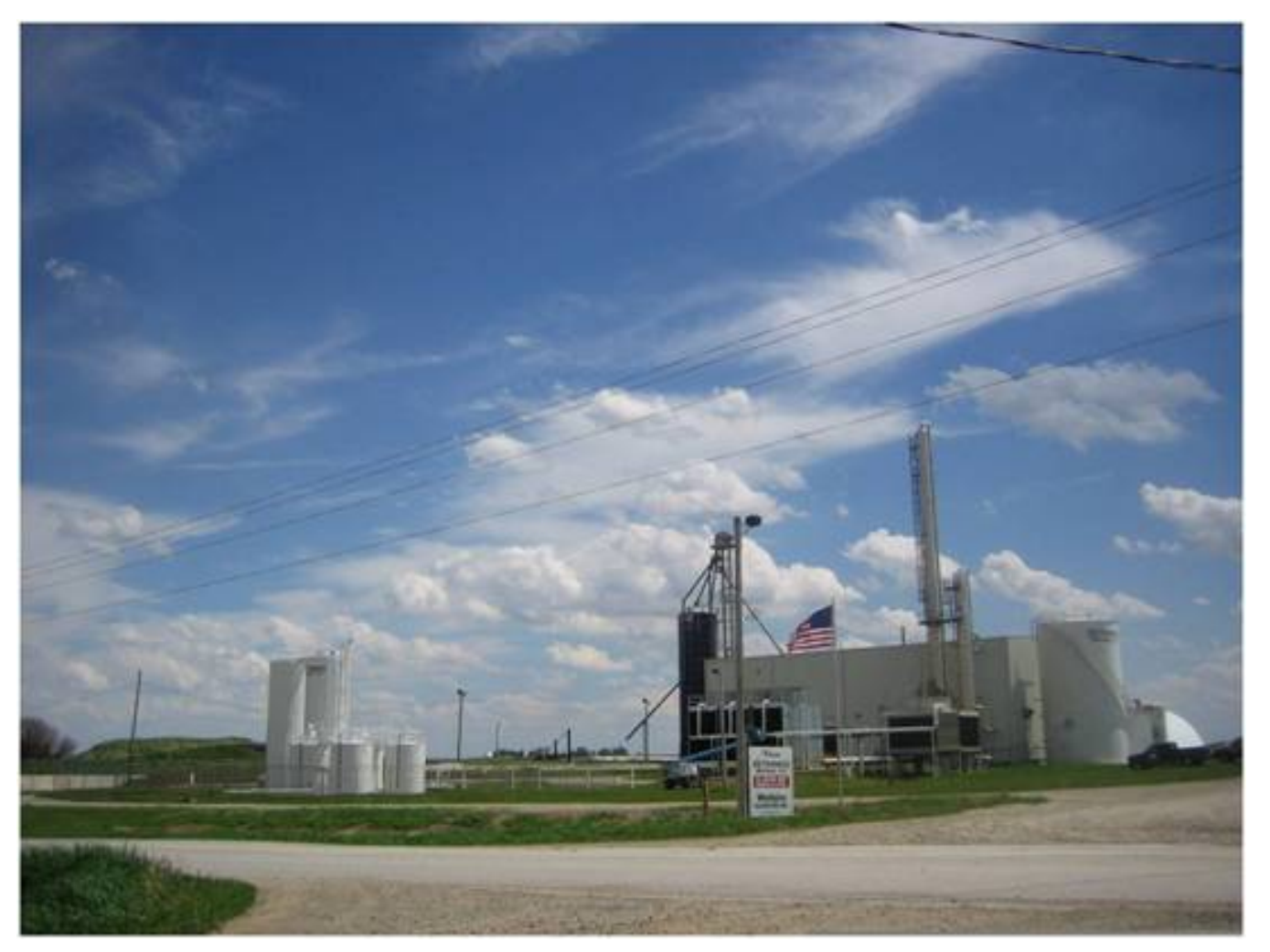
Figure 2: Fiberight biorefinery undergoing renovation to cellulosic ethanol.

6 million gallon per year cellulosic ethanol. Start Date: 2Q 2013.