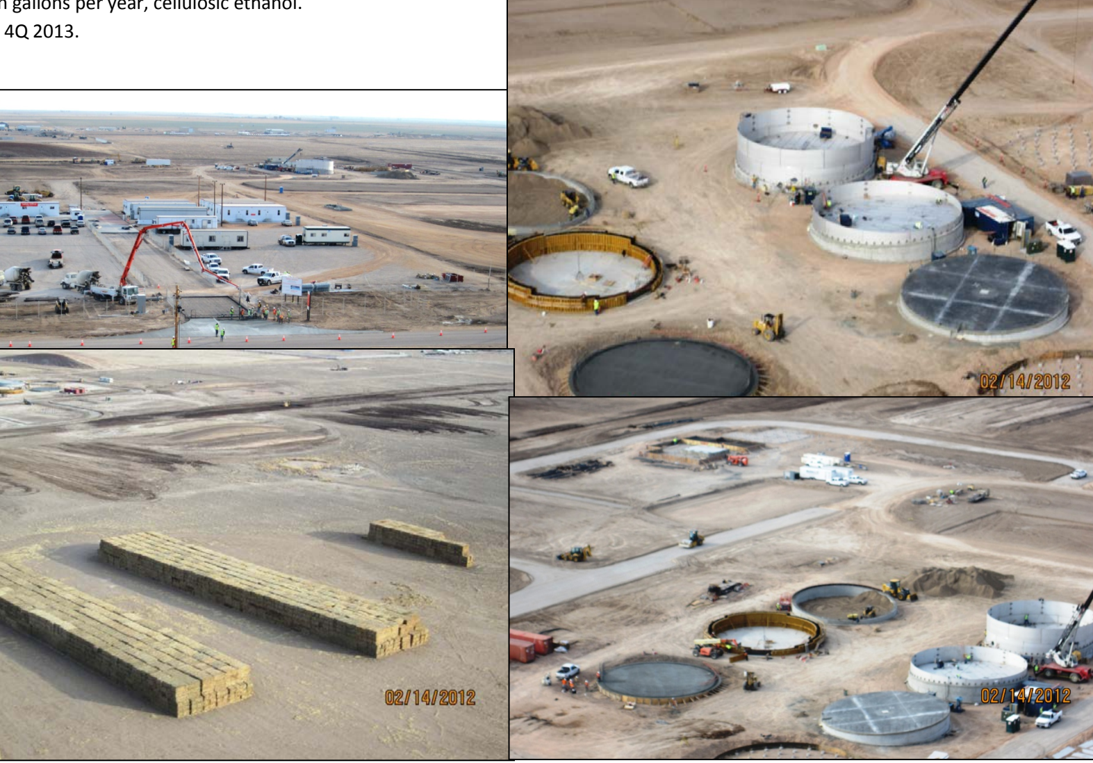
Figure 1: Abengoa biorefinery project stack yard.

26.5 million gallons per year, cellulosic ethanol. Start Date: 4Q 2013.