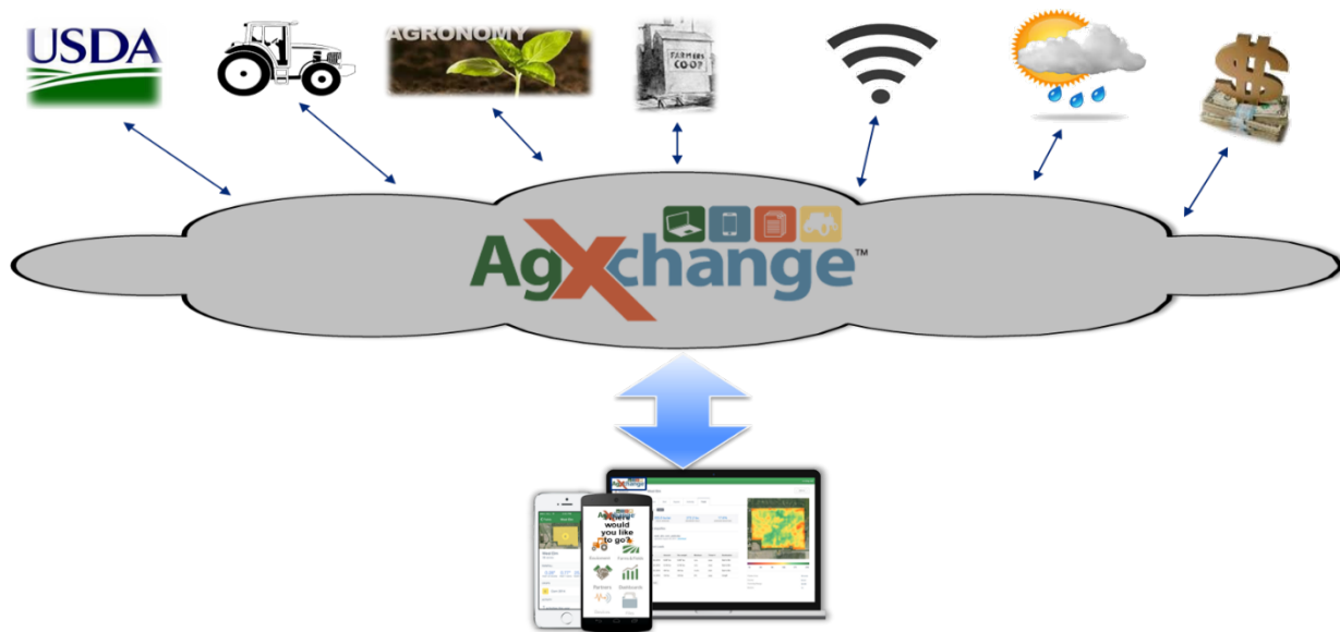
AgXchange Platform View (image above)

The map-based CLU layer alone does not provide a farmer with avenues to interact; therefore, a system needs to be in place to utilize it. Providing such a system was the inspiration for AgXchange™, and continues to be one of the fundamental value propositions of the AgXchange™ platform.