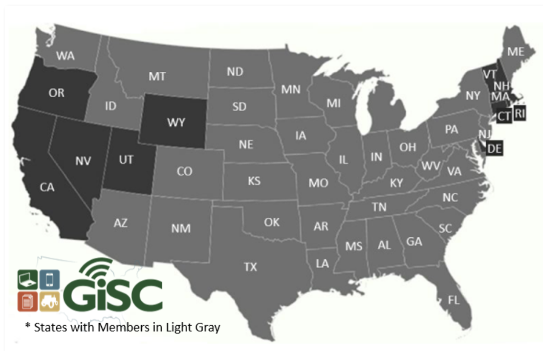
GiSC Footprint (map above)

The cooperative was birthed as an idea in 2010, but formally chartered in late 2012. Today we have 1,300 members in 37 states and are growing daily. The map below illustrates GiSC's footprint.