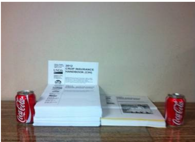
A comparison of paperwork in 2000 versus 2012

follow at the risk of losing our agency.