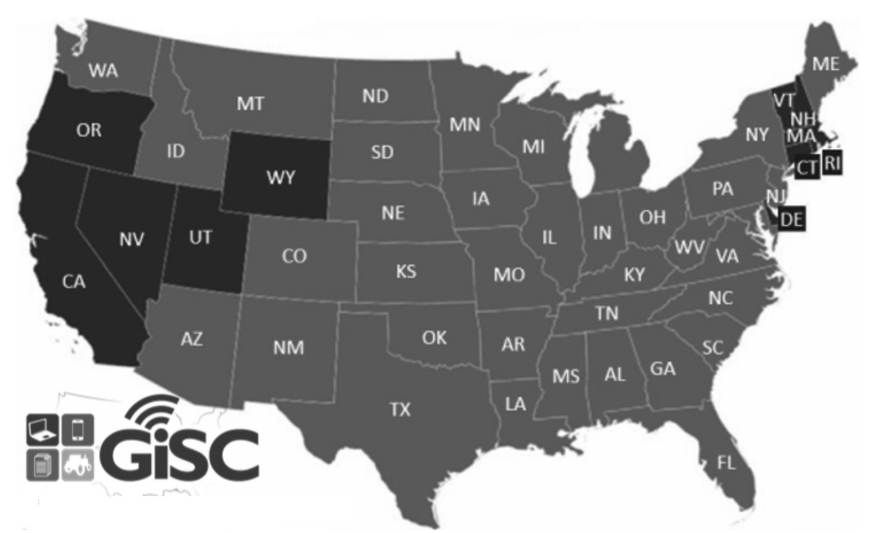
*States with Members in Light Gray.

Beyond 1,300 growers in membership, we estimate that we have had direct personal communications with over 10,000 growers. These conversations indicated that 99.9% of those growers think forming GiSC was a good idea. Some thought it was such a good idea, they joined immediately. Even more exciting, most that did not join immediately left us with the impression that they would join soon after we deployed our platform technology, AgXchange<sup>TM</sup>. This platform for growers has just been deployed and is available to all growers who are members of GiSC.